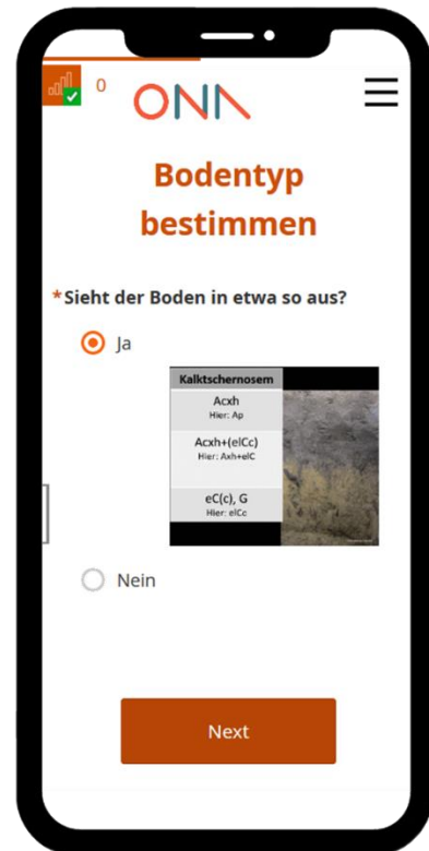
Smartphone image cut out from http://www.pngall.com/?p=35820 , license CC 4.0 BY-NC